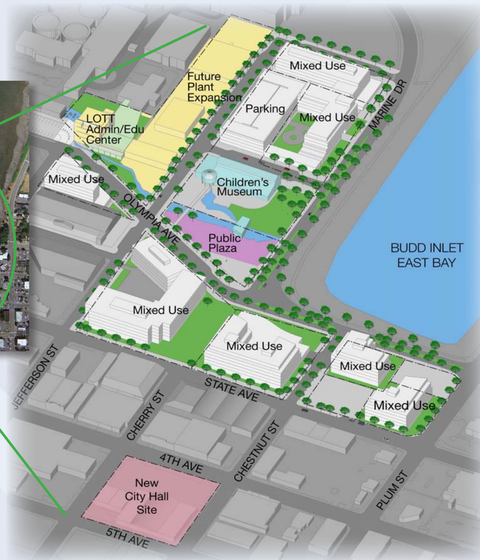
Conceptual rendering to show project locations

LOTT is purchasing the .72-acre site from the Port and will oversee the development, environmental cleanup, operation, and maintenance of the plaza. The partners will work together on plaza design, and the City and LOTT will share cleanup and development costs.